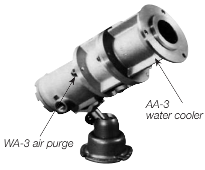
Air purge, water cooling and swivel base mounting accessories

The SB-1 swivel mounting base lets you aim the line of sight. You can tilt, swivel and lock the mounting base in place.