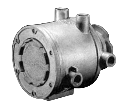
EE-2 Water-cooling enclosure

steam and other impurities. A flow of clean, dry industrial air will keep the optics clear under most industrial conditions.